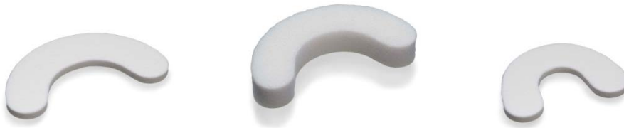
Figure 2 Bite Pad Standard to the left, Edentulous in the middle and Pediatric to the right

The Bite Pads are available in three versions, Regular, Edentulous (toothless) and Pediatric (Figure 2). The self-adhesive pads are attached on the mouth piece to protect the teeth during exercise.