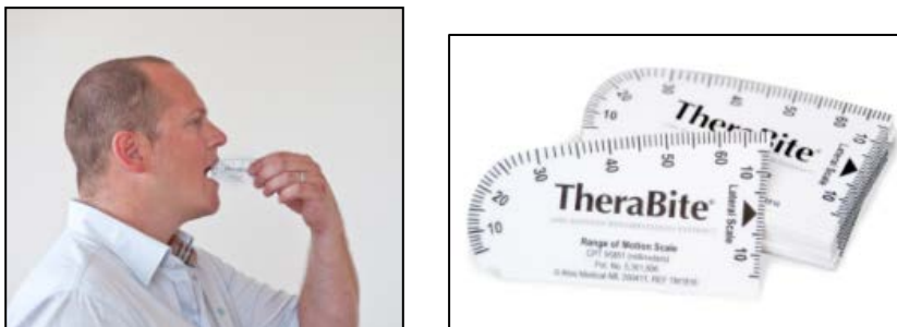
Figure 3 Range of Motion Scale (RAM)

The disposable Range of Motion Scales is used to measure and monitor progress of the exercise, by the user or his/ her clinician.