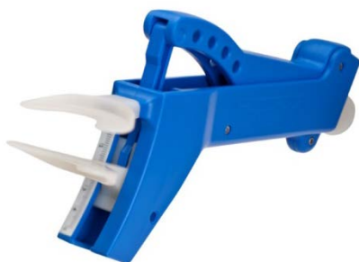
Figure 1 TheraBite® Jaw Mobilizer

The TheraBite Jaw Mobilizer (Figure 1) utilizes repetitive passive motion and stretching to restore mobility and flexibility of the jaw musculature, associated joints, and connective tissues. The TheraBite is the only device available which provides patients with anatomically correct jaw motion. It also helps reduce patients' anxiety by allowing them to control the extent and length of each stretch. While conventional therapies offer mostly stretching to increase jaw opening, the TheraBite provides both anatomically correct stretching and passive motion for effective jaw rehabilitation therapy. The device is available in an Adult and a Pediatric version.