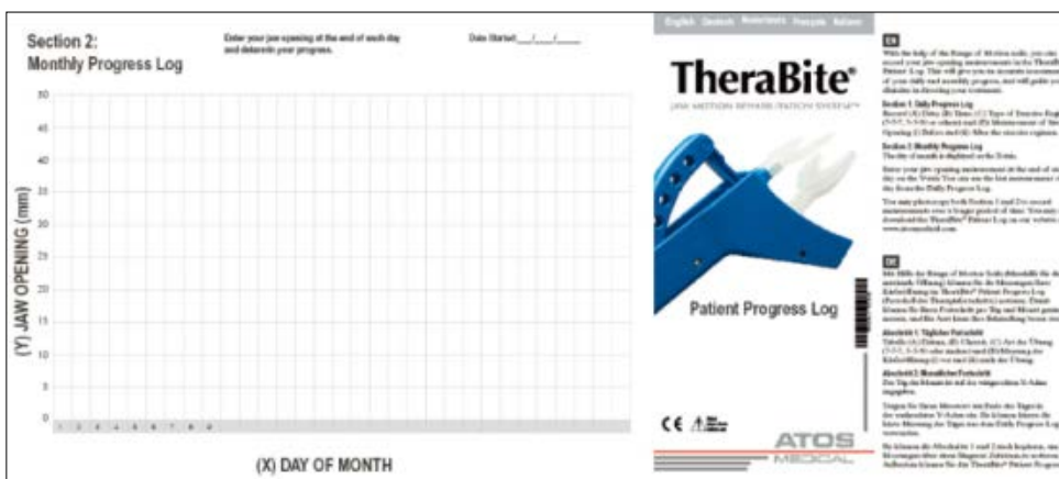
Figure 4 Patient Progress Log

The Patient Progress Log helps the user and his/ her clinician to record the progress on a daily and monthly basis.