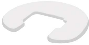
Figure 5 Hand-Aid

The Hand-Aid assists the user to maintain a constant opening during stretching or strengthening exercises.