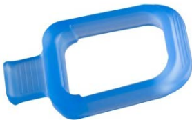
Figure 6 TheraBite® ActiveBand™

The active resistive exercise can be used in combination with passive stretching, but can also be used independently.